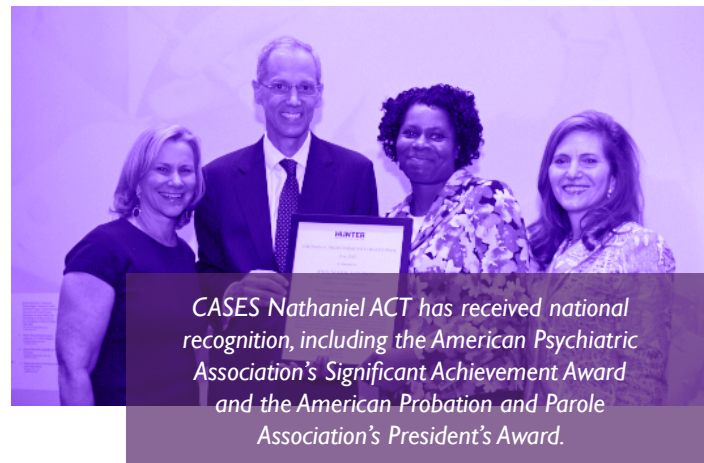
CASES Nathaniel ACT has received national recognition, including the American Psychiatric Association's Significant Achievement Award and the American Probation and Parole Association's President's Award.