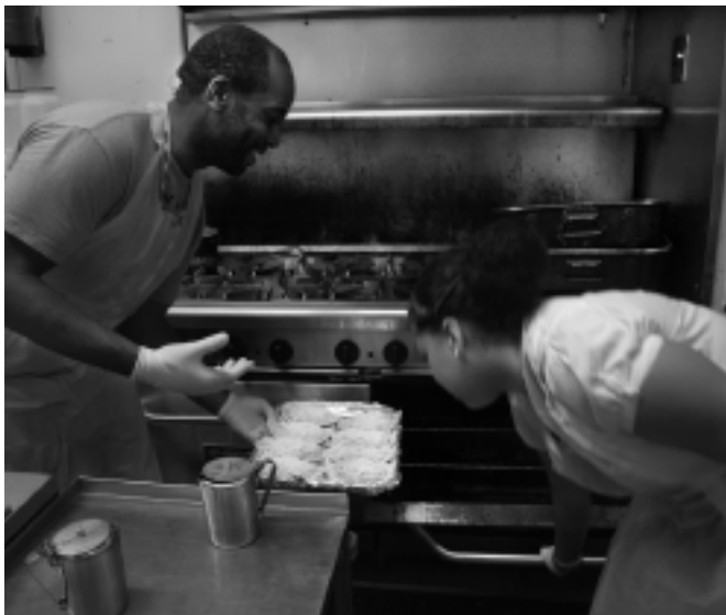
Choices' Healthy Cooking class teaches participants about nutrition basics while developing practical skills in preparing simple, wholesome meals.

Choices serves young people facing juvenile detention in New York County Family Court, including probation violators or youth at risk of violating probation. For more information about program eligibility, please contact our staff.